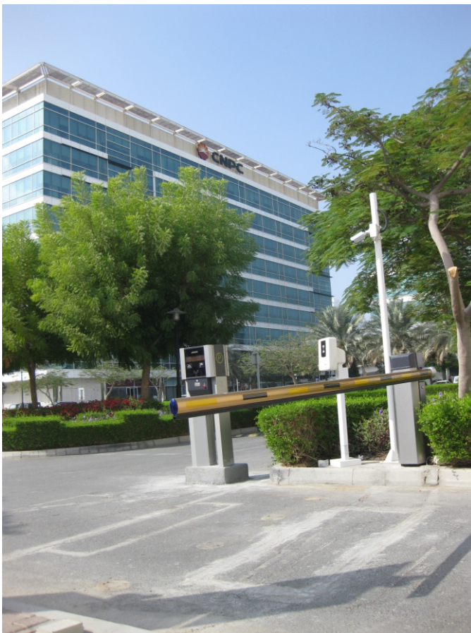
Office building in Dubai