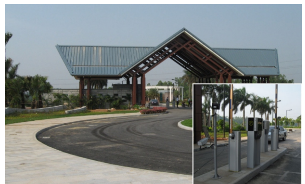
Shenzhen Golf Course