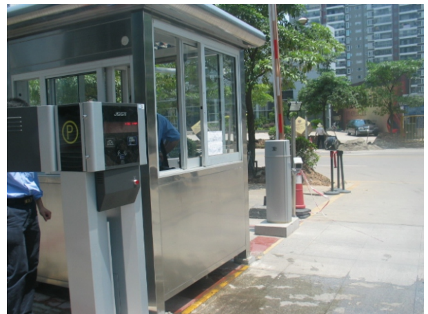
Shenzhen Long Gang City Center