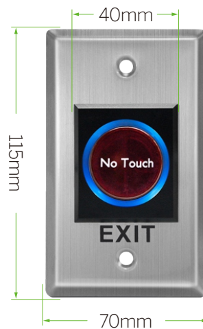
EB-16 115 x 70 x 25mm