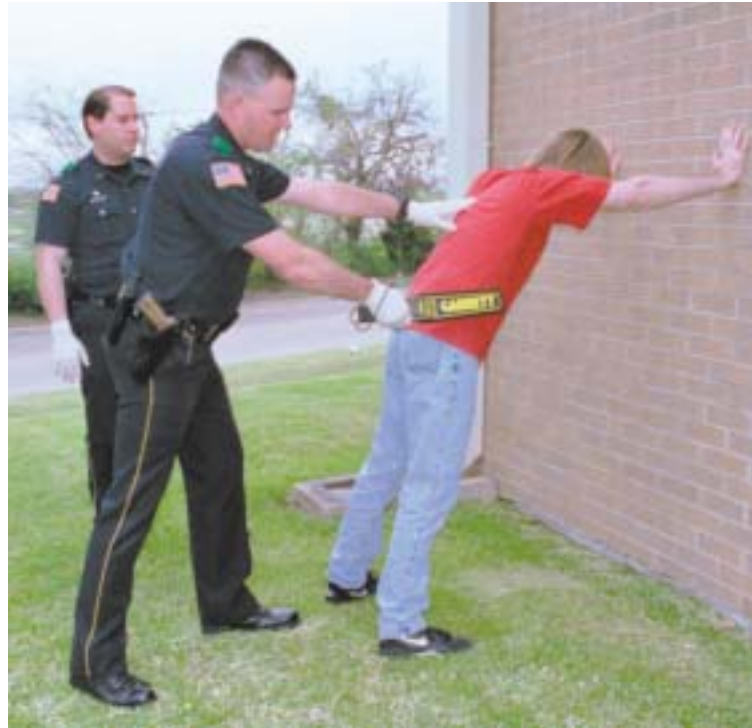
Garrett's Super Scanner can search any suspect thoroughly and safely.

body. They are a safe and effective method of determining the presence of metal on a suspect. When used in conjunction with the agency's search and seizure policy, metal detectors can reduce the occurrence of injuries and deaths caused by deadly concealed metallic object such as guns, knives, razor-blades and hypodermic needles. Using a Super Scanner when searching suspects, combined with a diligent and thorough effort to identify all detected metallic objects, can help save the lives of officers in the future.