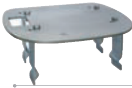
ACG8108 BASE PLATE for K500