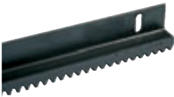
ACS9050 Module 4 RACK in iron (sect. 22 x 22 mm) with CATAPHORESIS treatment, right-angle (up to 2200 kg) recommended for K500 FAST - in 2 m bars per m