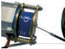
ACJ9015 ELECTROBRAKE for JOLLY 20, 22, 22S and 24 assembly with 6 m cable, sheath and release knob