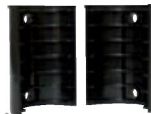
ACJ9058 PAIR OF HALF-SHELLS for JOLLY BIG ONE & TWO on shaft Ø 76 => Ø 102 mm