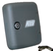
ACJ9071 STRONG-BOX FLAT wall mounted (special lock) IP 44 with 1 rocker switch and electrobrake release