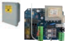
ABJ7080 J-CRX control board for 1 JOLLY with thrust regulator and radio receiver 433 MHz. See page 92 and 97