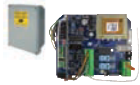
ABJ7081W J Wi-Fi control board for 1 JOLLY with thrust regulator and MASTER Wi-Fi. See page 76, 92 and 97