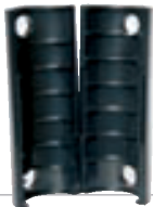
PAIR OF HALF-SHELLS (not for JOLLY BIG) ACJ9030 Ø 42 => Ø 48 mm ACJ9040 Ø 42 => Ø 60 mm ACJ9050 Ø 48 => Ø 60 mm