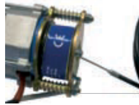
ACJ9019 ELECTROBRAKE for JOLLY ONE and JOLLY BIG assembly with 6 m cable, sheath and release knob