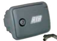
ACJ9078 STRONG-BOX STONE to embed (special lock) IP 44 with 1 rocker switch and electrobrake release