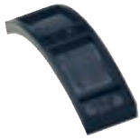
ACJ9055 PULLEY ADAPTER Ø 200 => Ø 220 mm specific for JOLLY ONE