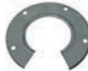
ACJ9060 COMPENSATION FLANGE Ø 220 mm (for JOLLY 22 and JOLLY 22 SUPER)