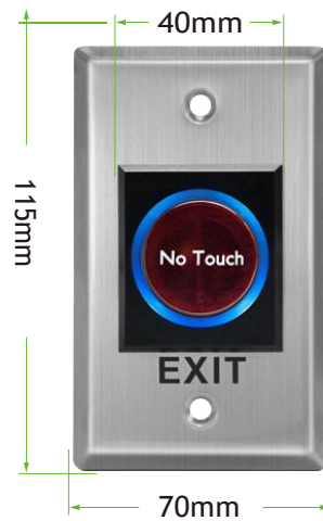
EB-16 115 x 70 x 25mm